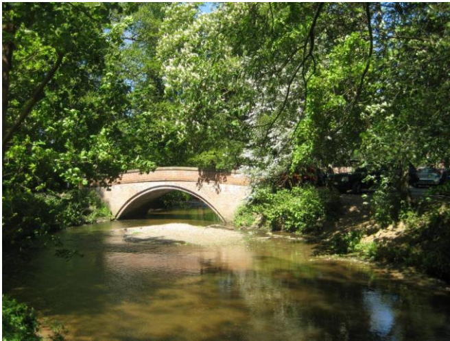
Twinnies Bridge (The Friends of the Carrs)