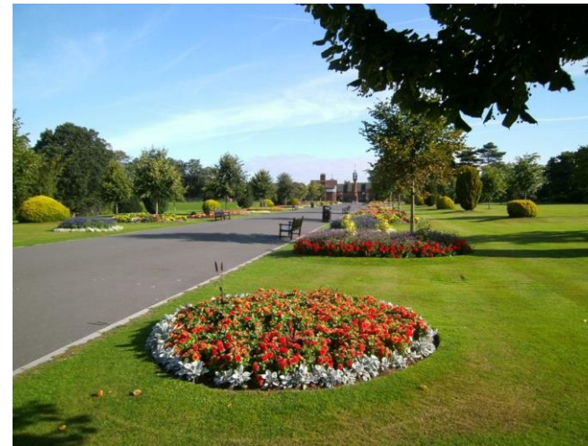
Queens Park Crewe

Urban Parks contributing to our quality of life