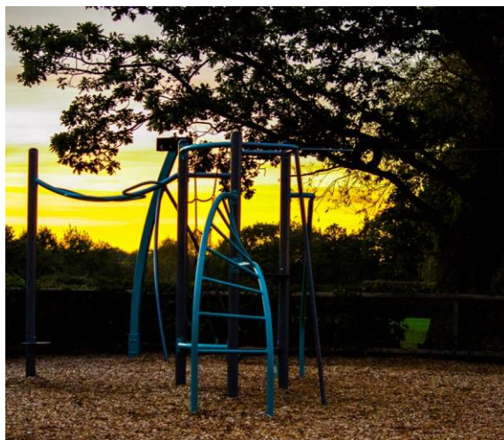
Park play at sunset

Objective 3: We will aim to provide facilities that meet the needs of the different age groups using our parks but also to ensure that social cohesion building, inter-generational activity is facilitated.