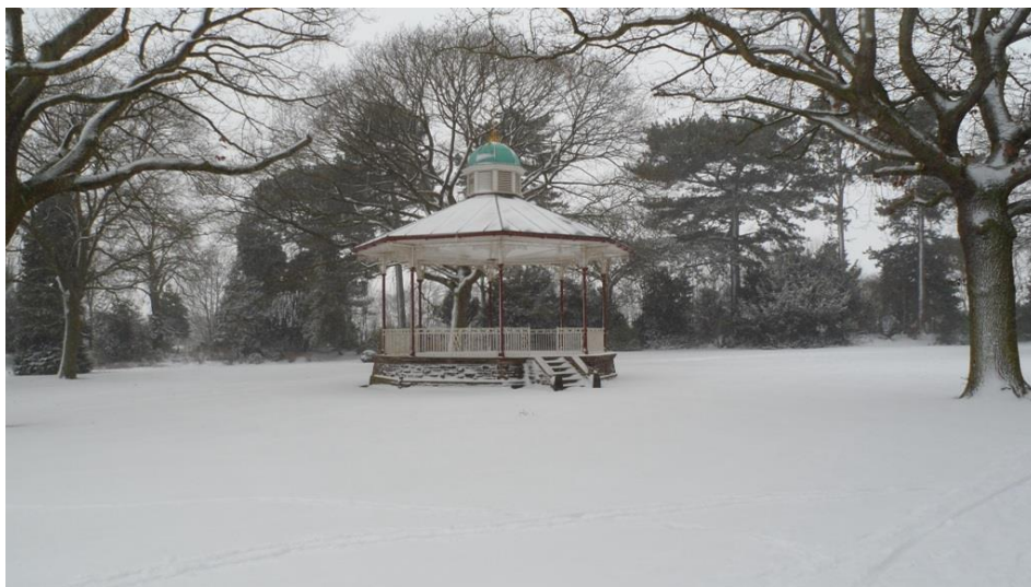
The restored bandstand at Queens Park, Crewe