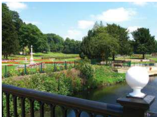
Congleton Park (Post restoration)