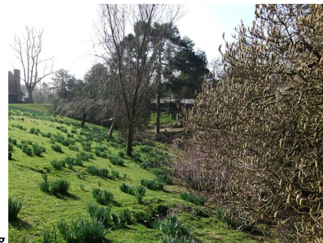
The Coronation Valley at Queens Park, Crewe in the spring

Objective 4: We will aim to achieve more collaborative working with the Health & Wellbeing Board and by doing so target investments to ensure that maximum health; well-being and sustainability benefits accrue from our public parks and open spaces.